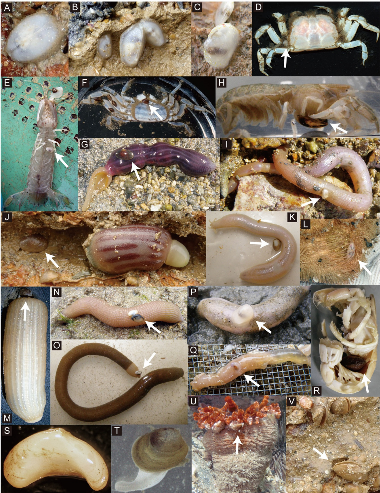
Figure 1 (See legend on next page.)